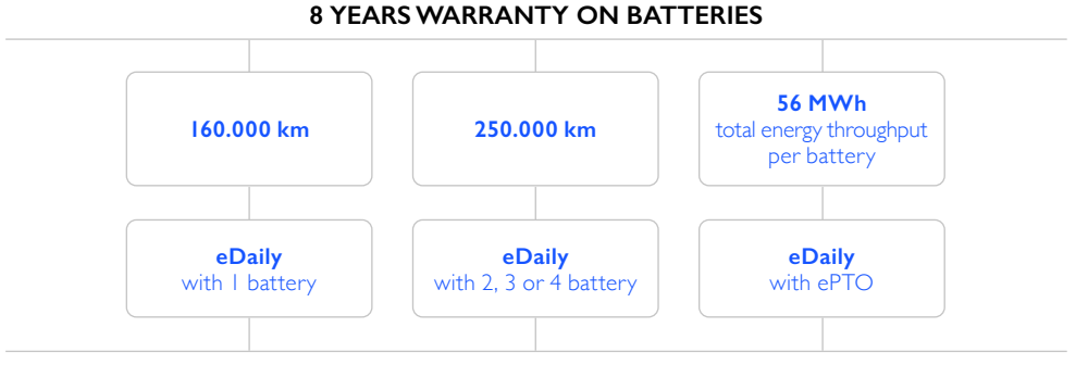
BATTERY SUBSTITUTION WHEN CAPACITY <80%

The FPT Industrial 37 kWh modular battery has a best-in-class 95% ratio between installed and usable energy.